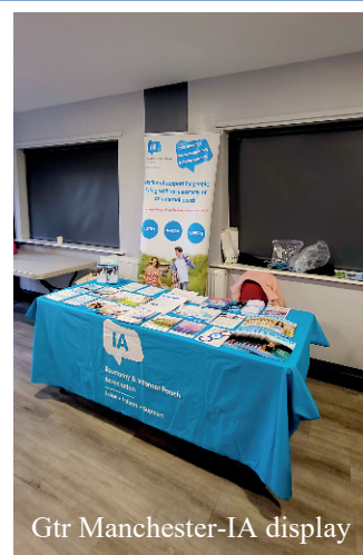
Gtr Manchester-IA display

Refreshments were served throughout and there was a bar open if anybody wished to have other drinks.